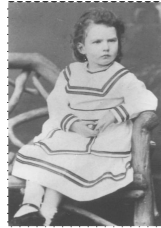
This is the picture of Gertrude Bell when she was young and old.

Did you know that Gertrude Bell could speak in 6 different Languages? In this report you will find out all about Gertrude Bell's travels and where she travelled, why she travelled and who she travelled with. Read the information text to find out more!